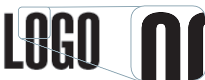
ENLARGEMENT SHOWING SMOOTH EDGES

Following these guidelines will ensure your Logo reproduces well with smooth edges, on press.